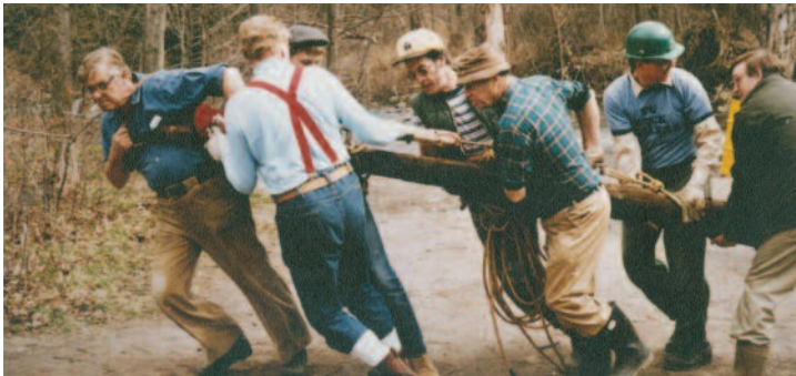
20th Century Workday Volunteers – Were you there?

Check www.creditvalleyca.ca/about-cvc/events-calendar