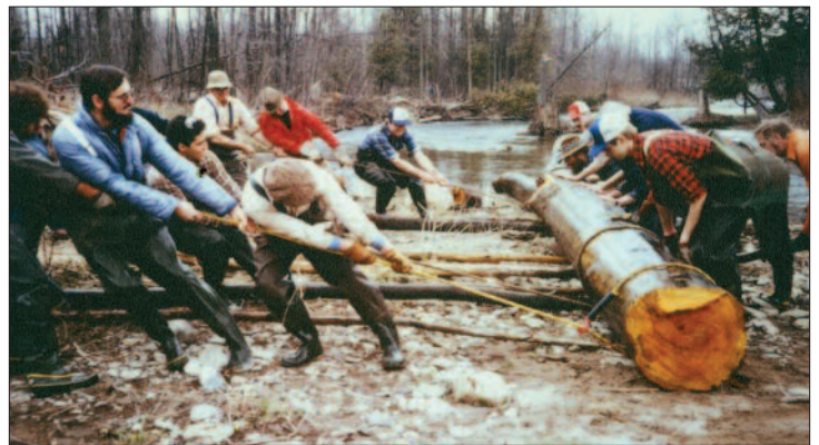
Win-a-Hat at the AGM! – What year? Where on the Credit? Who?

C3 has been exploring the potential for bringing a RAIN program to Orangeville. As a first step, the Town is planning to conduct a survey of older sewer lines to identify areas where cross flow is a problem. This will provide a focus for further activity. In the meantime we are continuing to explore how we would fund and manage a RAIN program.