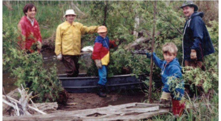
The family is still always welcome – A Workday from the 80's or 90's. Can you identify the boys?

www.creditvalleyca.ca/about-cvc/events-calendar