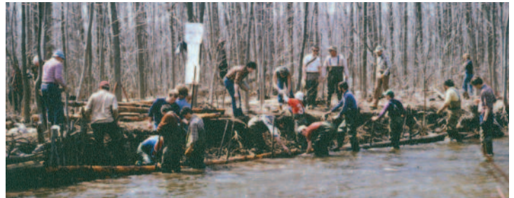
20 Volunteers restoring our River. Who do you know?

Much National Staff time has been devoted to issues related to the new Federal Fisheries Act, its intent and implications for new Policy and Regulations. TUC has been providing input to this process to DFO and their Minister and ADM. Also, TUC and other partner CNGP's have been discussing the new Fisheries Partnership funding announced in the Federal Budget but we do not know what or how this money will flow and to whom.