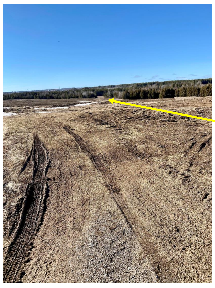
Photo 1. Looking northwest from entrance to property off Cty. Rd 52 Note "gap"